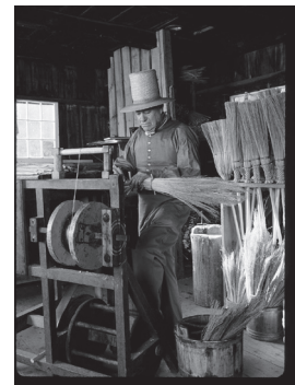
OSV Broom Maker

Northeast Regional Conference on the Social Studies Tuesday, April 12 - 7:30 A.M. to 5:00 P.M. Wednesday, April 13 - 7:30 A.M. to 3:00 P.M.